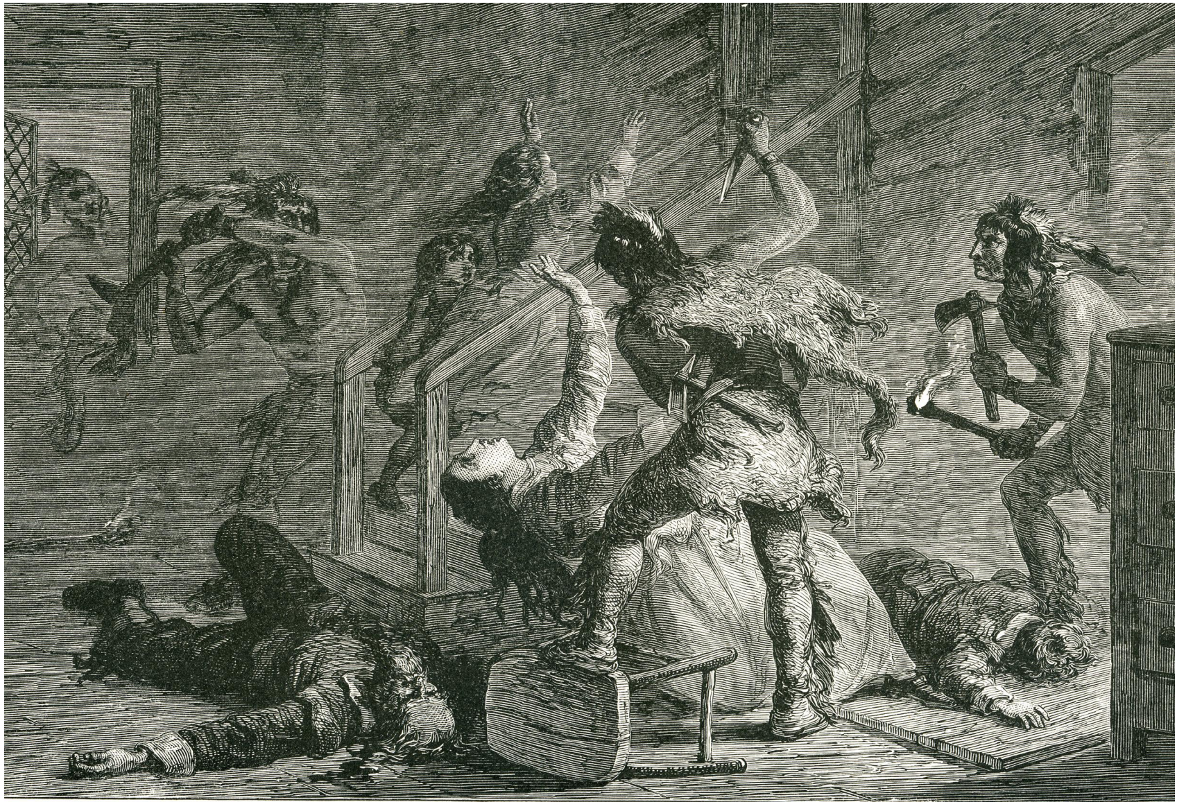
Nineteenth-century engraving depicting the Eames massacre