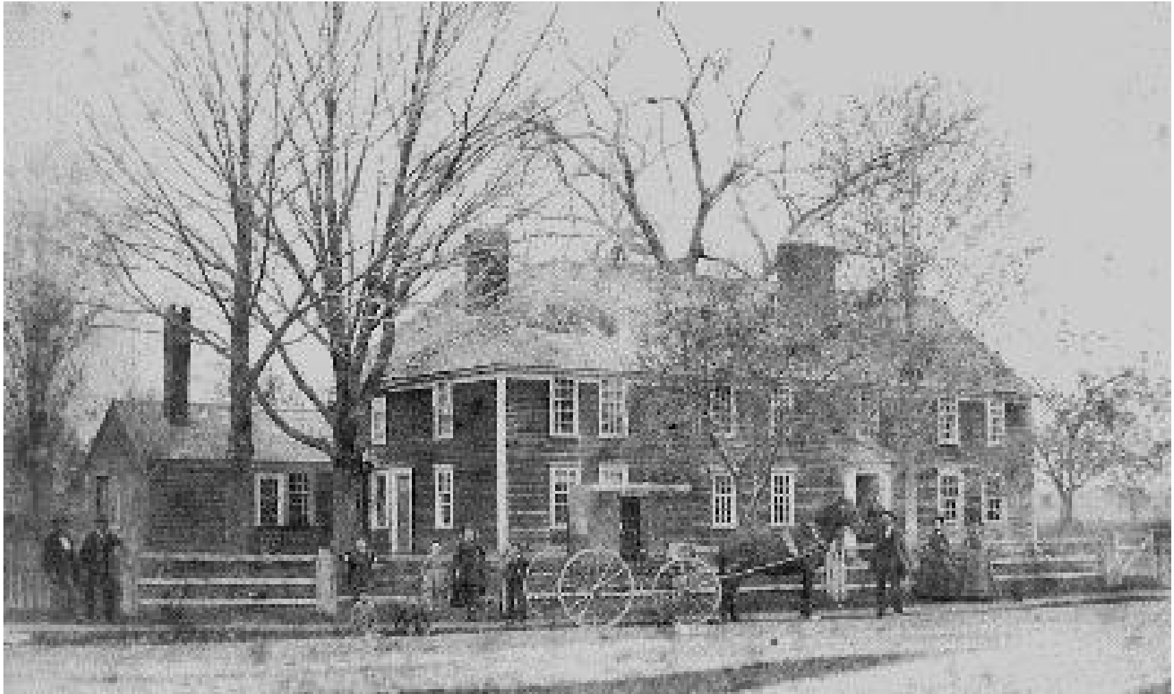
The Eames Red House ca 1870 when it used to be along Union Avenue.